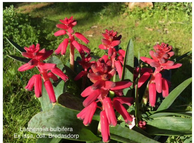
Lachenalia bulbifera Ex 155a, coll. Bredasdorp

As mentioned above, details of the date and speaker for the Spring 2022 meeting will be circulated when they are decided.