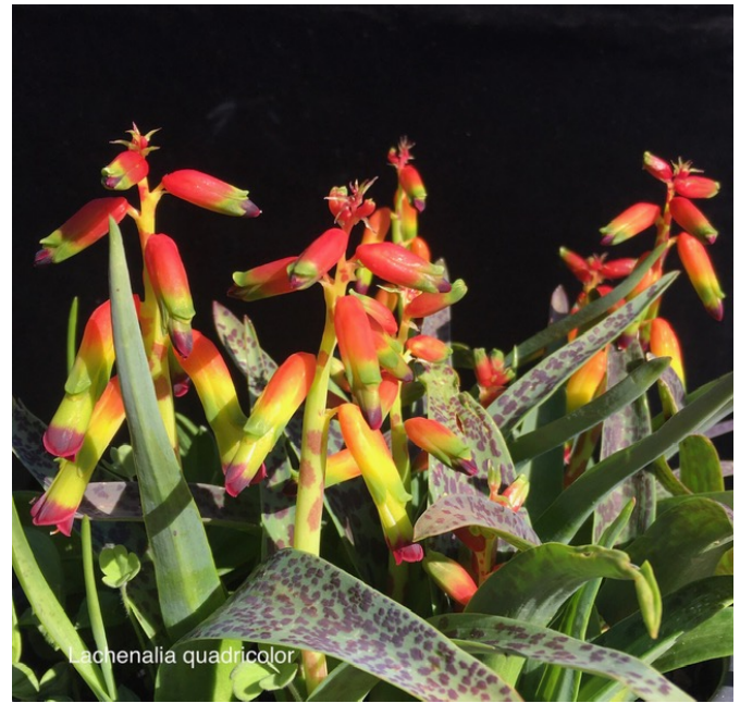
Lachenalia quadricolor