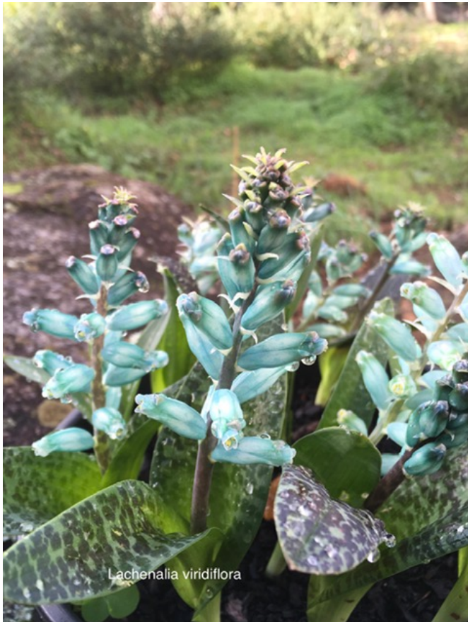
Lachenalia viridiflora [Uli Urban]

Following the articles on light levels and growing plants outdoors in sunnier climates in Newsletters 43 and 44, I have included some more photos from Uli Urban, showing three of his Lachenalias growing in his garden in Portugal. Their compactness is impressive, for those used to more northerly latitudes.