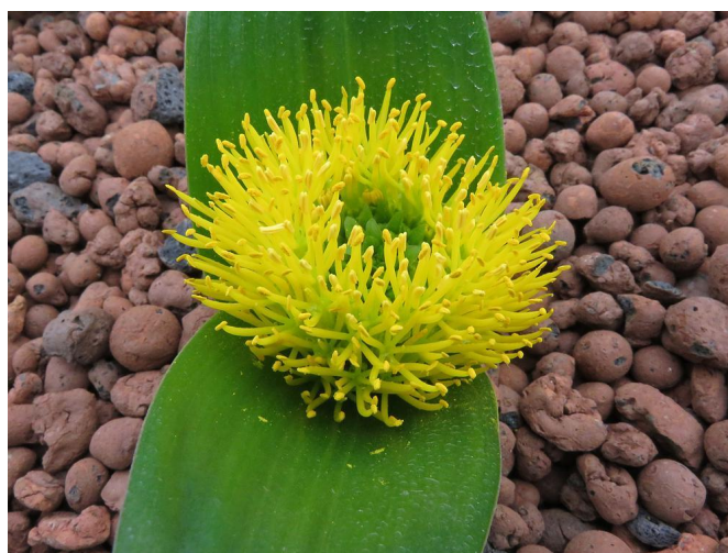
Daubenya stylosa